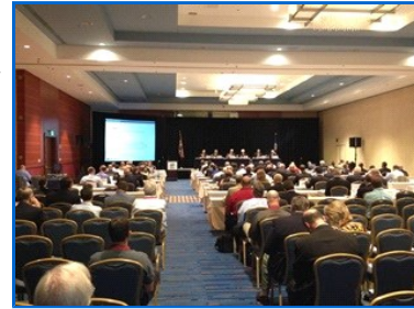
A view from the House of Delegates Meeting

I attended my last House of Delegates meeting as the WSPE National Director in Minneapolis two weeks ago.