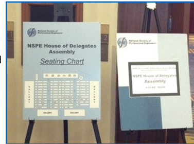
Signs from the House of Delegates Meeting